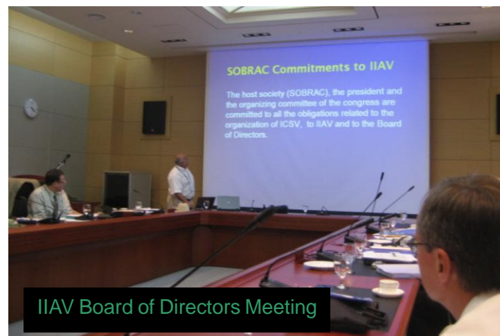
IIAV Board of Directors Meeting