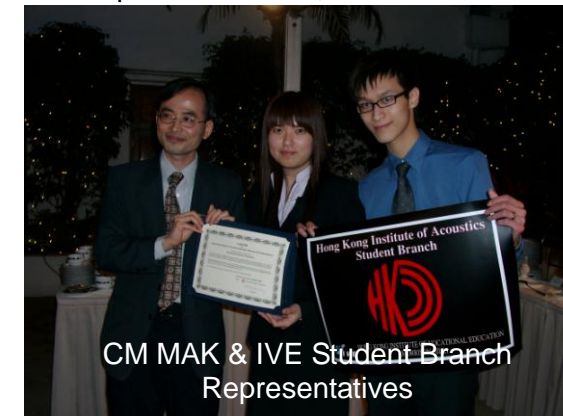
CM MAK & IVE Student Branch Representatives

It was encouraging to know from his report that the first registration fee for any member who could present the road traffic noise study report on behalf of the Institute. He also indicated that the Institute had in August 2007 bid for hosting InterNoise 2011, and was subsequently selected as one of the two member societies to submit a final proposal.