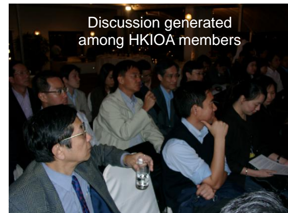
Discussion generated among HKIOA members