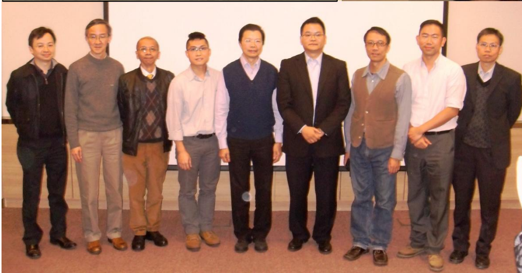
Organising Team and Speakers