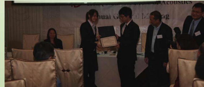
Handing over of the Student Branch (IVE) to the new Branch Chairman