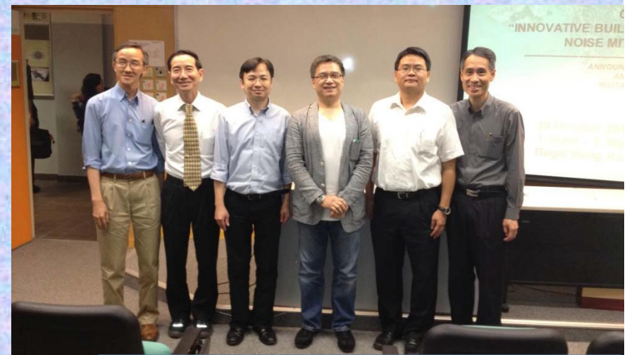
Group photo of organising team and speakers.