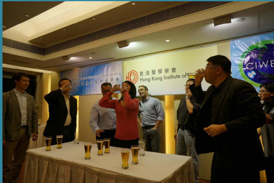
Beer drinking contest