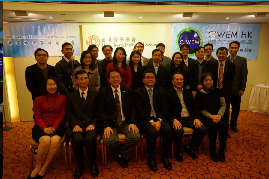
HKIEIA, CIWEM & HKIOA Committee Members