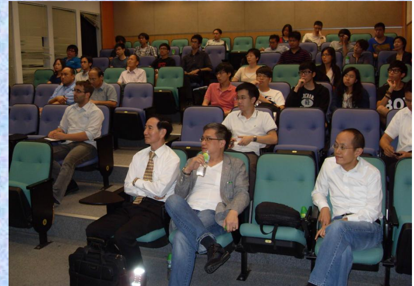
Participants showed great interest in the talks.