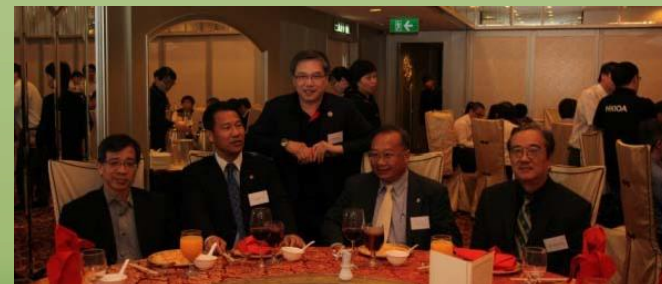
Members and guests at the Annual Dinner.