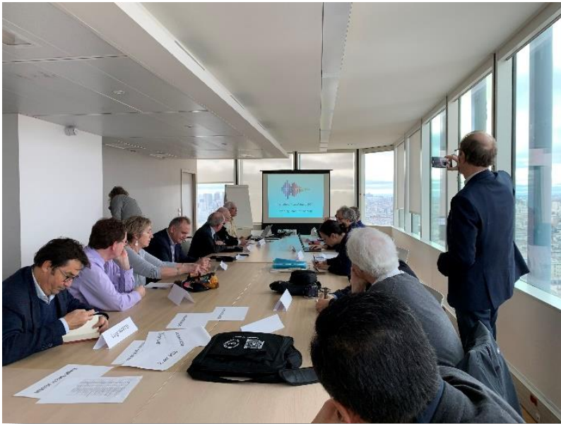
Steering Committee Meeting of IYS2020.