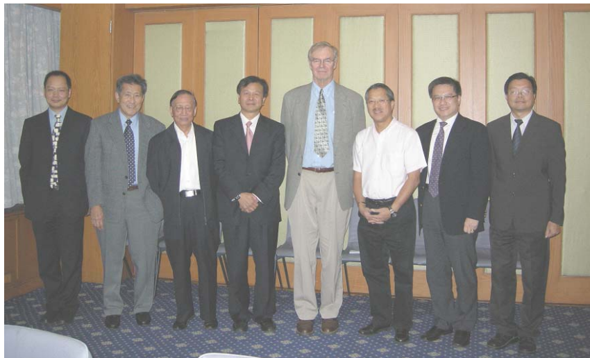
Exploring the possibility of combining the 2012 ASA / ASC joint meeting with the WESPAC XI in Hong Kong