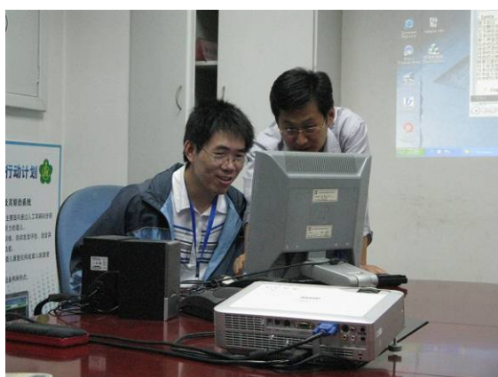
Demonstration of Speech Recognition System

Apart from attending distinguished lectures and technical sessions, we also joined a technical visit to the IACAS. During the visit, we had the opportunity to understand more about their research achievements in the development of speech recognition system, digital signal processing, underwater acoustics, and their laboratory facilities.