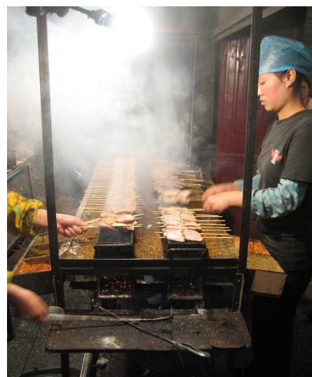
What a fun at “五哥鸡翅”!