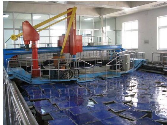
Underwater Acoustics Laboratory