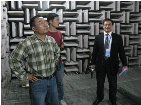
Anechoic Chamber of the National Laboratory of Acoustics