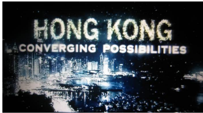
Our Chairman introducing HKIOA and Hong Kong to all the participants

We are now teaming up for the coming WESPAC XI. Let's join hands and make it a great success of the Institute! It can't happen without your full support.