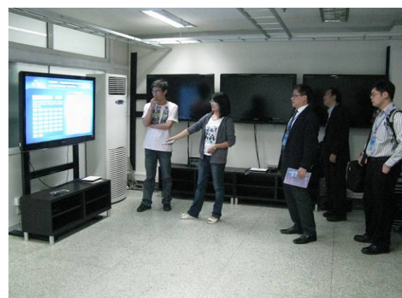
Application of DSP to TV Programmes