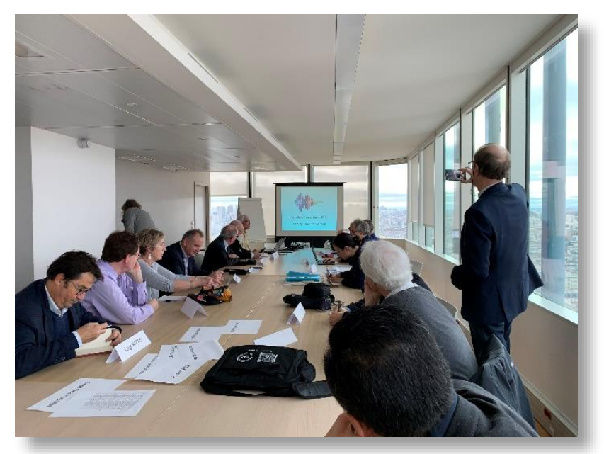
Steering Committee Meeting of IYS2020.